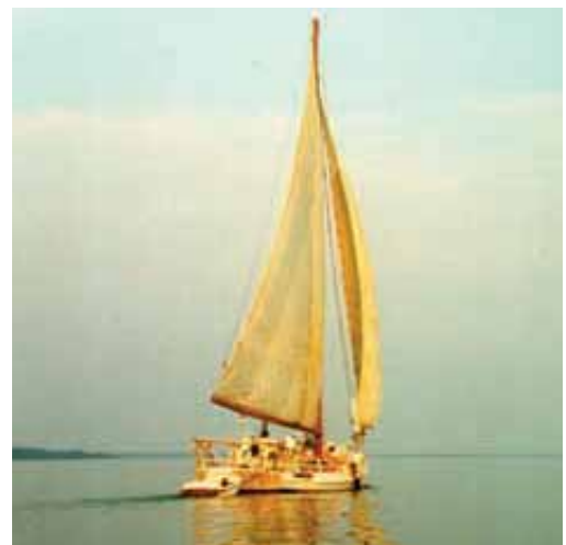
Skipjack Rebecca T. Ruark