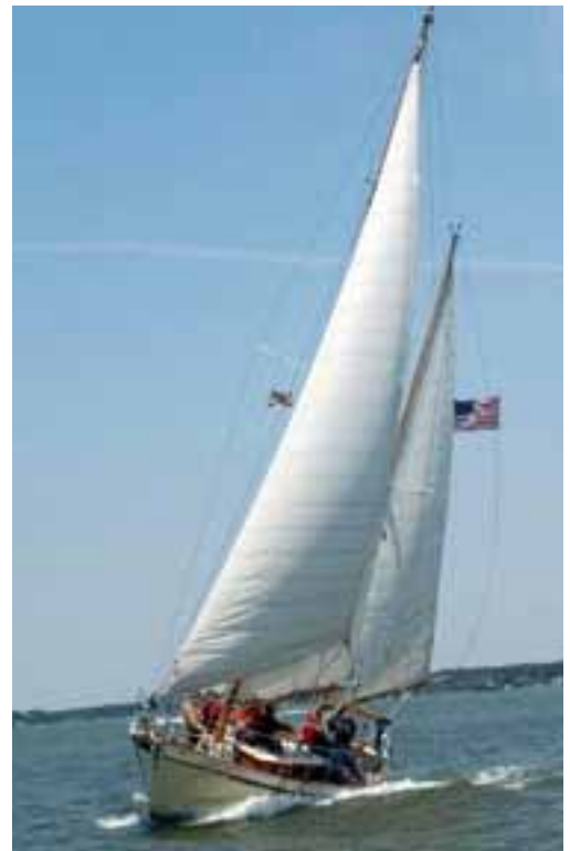
The Lady Patty

Golf – Pete Dye Championship 18-Hole Golf Course at Harbourtowne Country Club with discounts for guests of the Tilghman Island Inn.